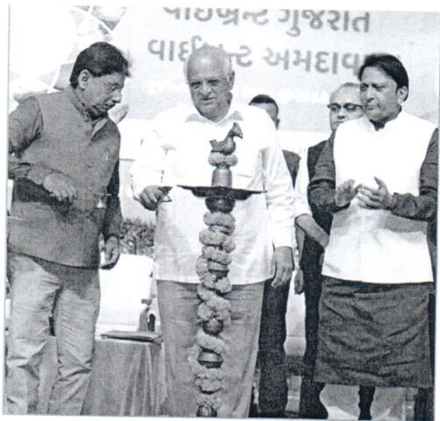
Vibrant Gujarat-Vibrant Ahmedabad