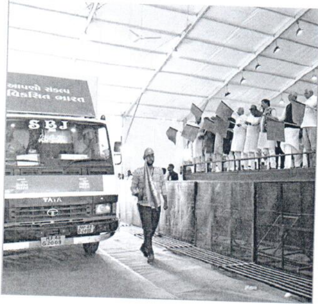
Viksit Bharat Sankalp Yatra, Ambaji