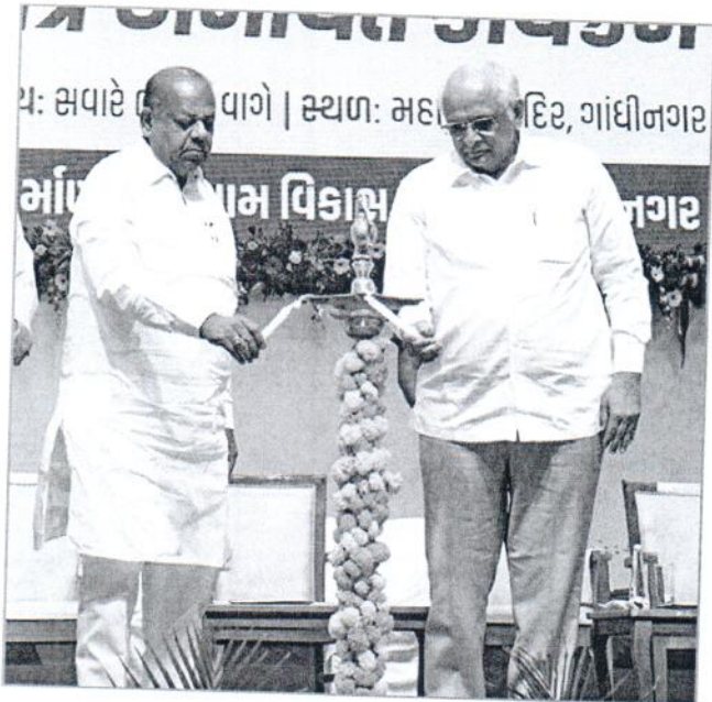
CM handovers appointment letters to candidates