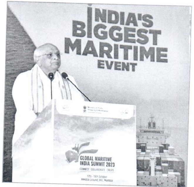
Closing ceremony of the Global Maritime India Summit 2023 in Mumbai